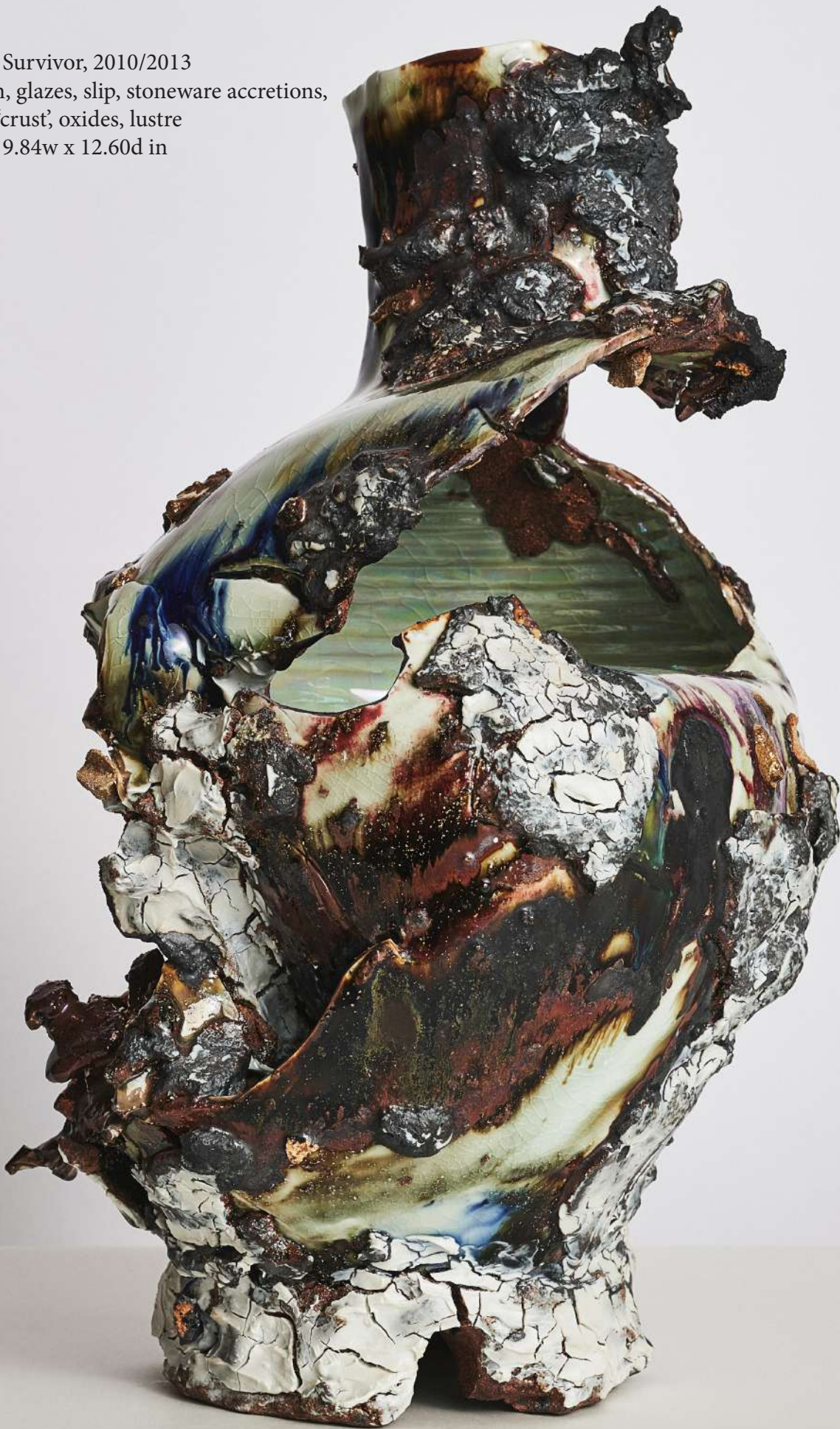
Unlikely Survivor, 2010/2013 Porcelain, glazes, slip, stoneware accretions, mineral 'crust', oxides, lustre 19.49h x 9.84w x 12.60d in