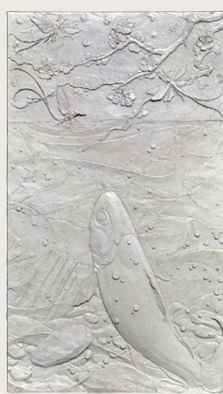
7. Betty Branch, Bent Torso, bronze, 13 x 11 x 12" 8. Wiford Gallery, Mayflies and Trout Rise, low relief bronze, ed. 3, 205/8 x 113/8 x 1/2", by J.D. Welsh. 9. Gary Lee Price, Ascent Wall Hanging, bronze, 70 x 19 x 8" 10. Gedion Nyanhongo, Life Blossoming 2, stone, 14 x 11 x 41/2"

water. The Sakura season was coming to a close and the petals were falling past me onto the flowing surface. I noticed a mayfly alight on the balcony railing-one then another and another. The trout began to rise among the blossoms."