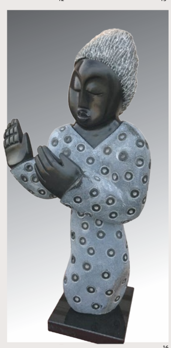
11. Southwest Gallery, Night Vision, bronze, 20 x 39 x 21", by Raymond Gibby. 12. Southwest Gallery, Bird Study No. 1, powder coated steel, 61 \times 23 \times 47 ", by Nic Noblique. 13. Gary Lee Price , Ascent Freestanding , bronze, 28 \times 6 \times 61 ." 14. Gedion Nyanhongo , Ready to Receive a Kiss , stone, 27 \times 12 \times 5 " 15. Southwest Gallery , Flora Bella A , painted steel, 51 x 19 x 11", by Michael Deming. 16. Gedion Nyanhongo, Welcome, stone, 22 x 13 x 6" 17. Betty Branch, Emma, bronze, 37 x 16 x 16"